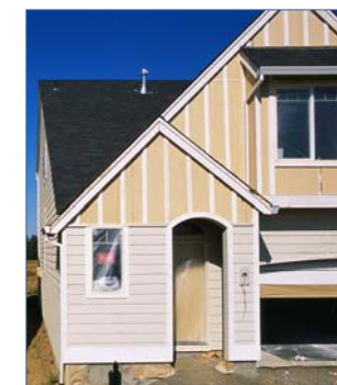
Could you rebuild your home from scratch?

The same is true if you have made substantial additions or improvements to your home. When in doubt, just give our office a call.